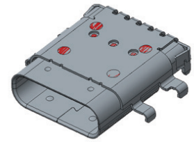
Top of Receptacle