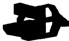
Key for Female Connectors