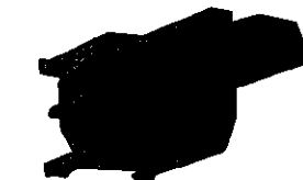
Key for Male Connectors