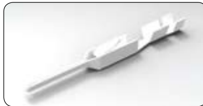
Crimp Snap-In Pin Contact