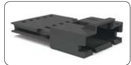
AMPMODU MTE Housing