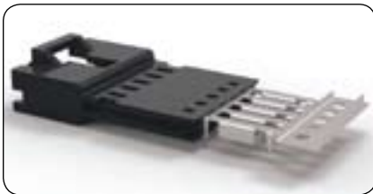
IDC AMPMODU MTE