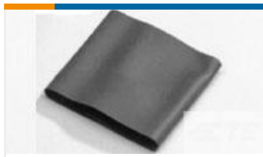
TE Model / Part #CX1859-000 V2-1.0-0-23MM