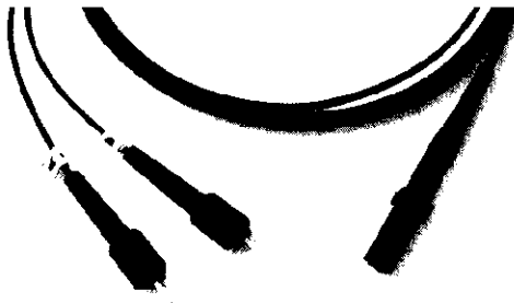
(ST-Style to MT-RJ)