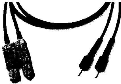
(Duplex SC to ST-Style)