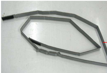
Picture 1 (防压边带: 1533277-3)

然后在产品reel的外围再缠上一条(1533277-3)防压边带(如下图1、2)。