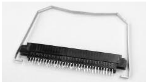
Part Number 6364125-x (Connector) Part Number 1364124-x (Spring Clip) Designed for Intel VRM 9.0 Specifications

Note: All part numbers are RoHS compliant.