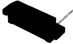
Housing and Covers are Preassembled; Cable Stabilizer is Separate.