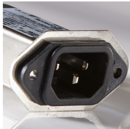
EJT Flanged EMI Filter