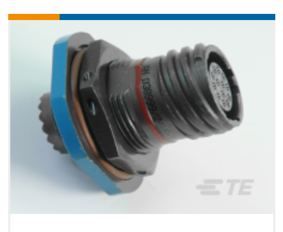
TE Part #YDTS24Z11-35PEV001 RECP ASSY