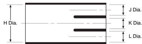
After Unrestricted Recovery (b)