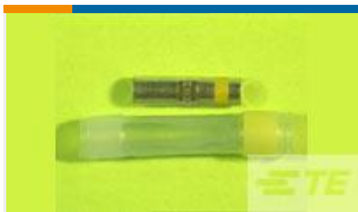
TE Part # 650075-000 D-436-37