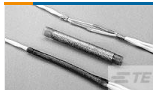
TE Part #F78917-000 B-500-02-108