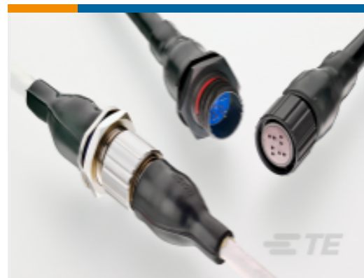
TE Part #2102352-5 CeeLok FAS-T, Receptacle Kit, Ni, B