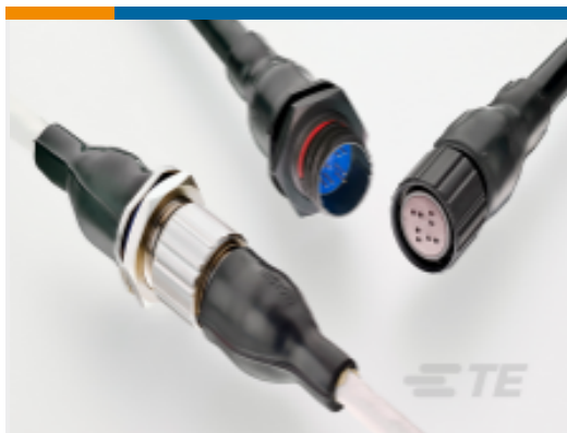
TE Part #2102353-5 CeeLok FAS-T, Plug Kit, Ni, B