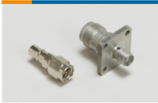
Between Series Adapters(1)