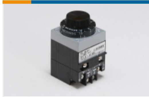
Time Delay Relays(214)