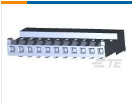
TE Model / Part #4-643820-1 11P MTA156 CONN ASSY 24AWG LF