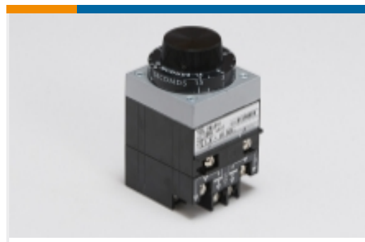
Time Delay Relays(214)