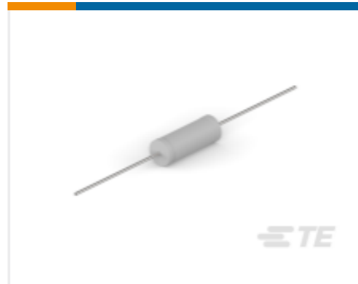
TE Model / Part #1-2176412-0 5W XSM M/OX 5% 12R