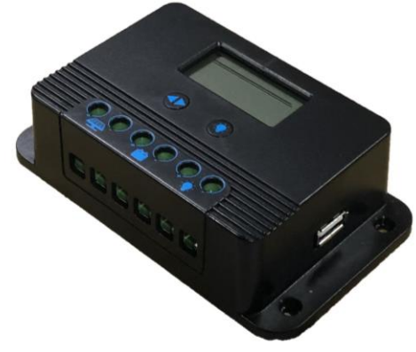
TP-SC24-20 Solar Charge Controller