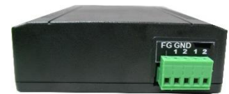
Back panel view