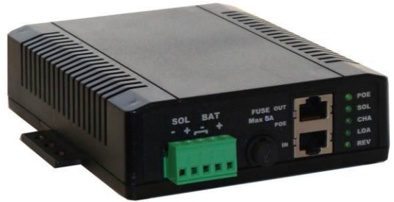
TP-SCPOE-2448-HP Charge Controller