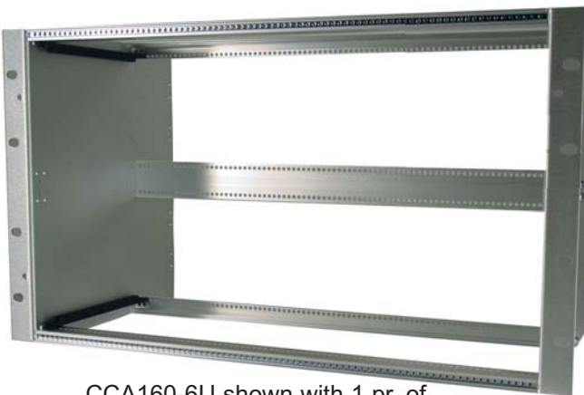
CCA160-6U shown with 1 pr. of CG1-160 card guides installed