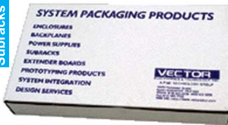
VectorPak™ Kit (CCK)