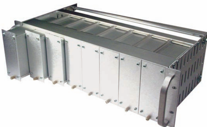
Assembled Module Subracks (CMA)