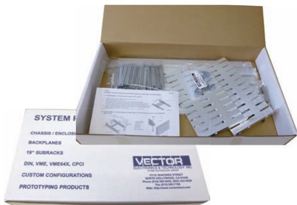
Subrack Kits (CCK)