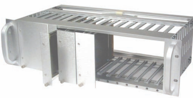
Assembled Card Mount Subracks (CCM)