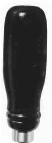
P138A - Handle