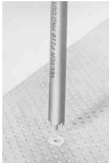
Shows pad removal & pad cutter P116C